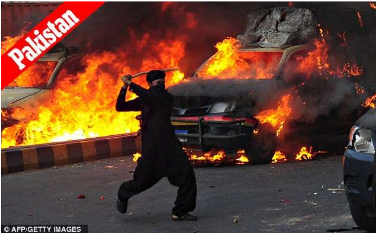
Flames of fury: A Muslim demonstrator brandishes a stick near burning police vehicles during the protest against an anti-Islam film in Karachi