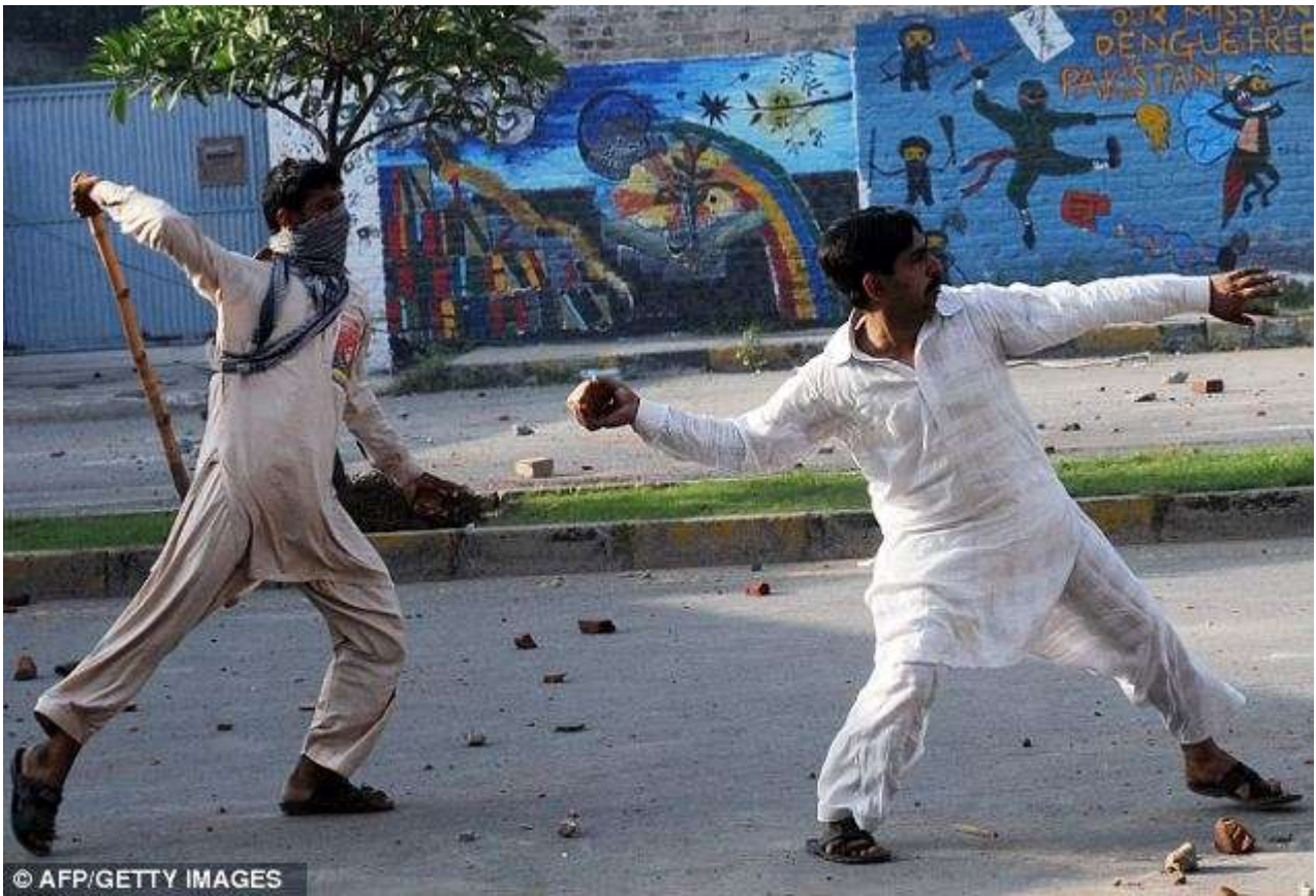
Violence: Two men throw sticks and stones in Lahore, Pakistan, where the death toll was up to 15 by early Friday evening