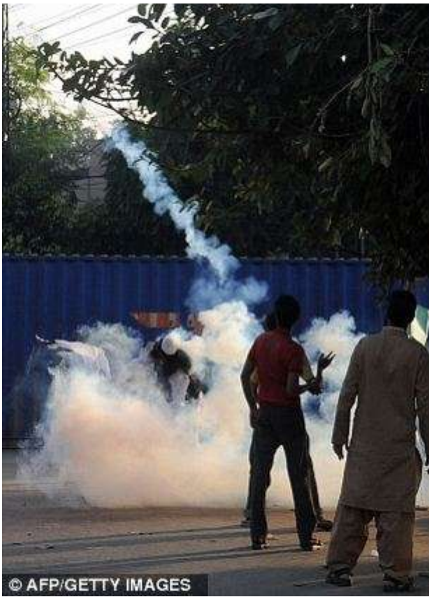
Deterrents: Protestors tossed tear gas over freight containers set up by police