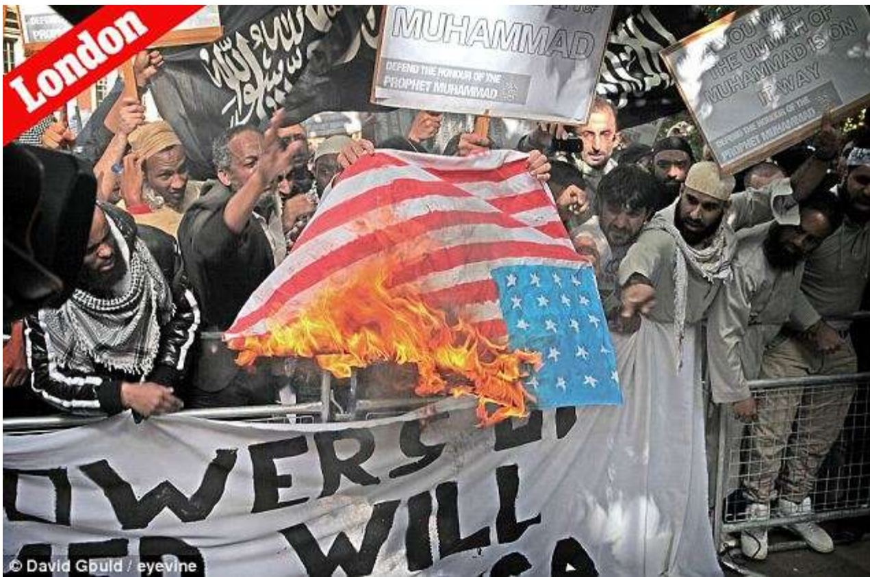
Peaceful turned fiery: Even the demonstration outside the American embassy in London was combustible