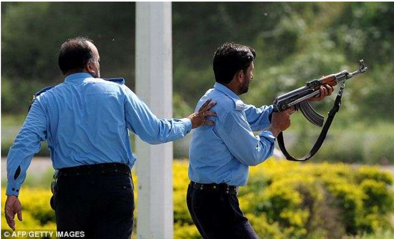
Taking fire: A Pakistani police officer fires into the crowd at an protest in Islamabad on Friday