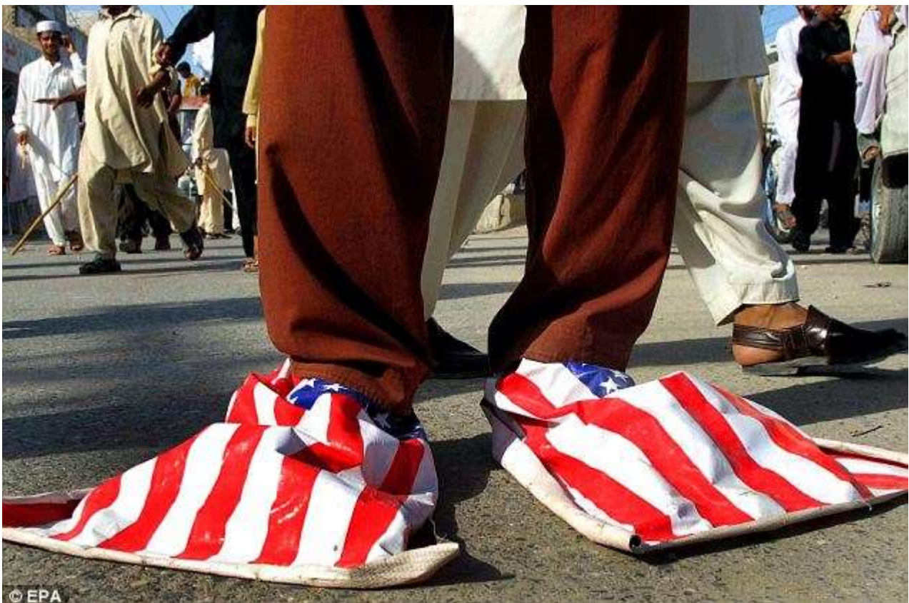
Disrespectful: The Pakistani protestor put the American flag where he feels it belongs