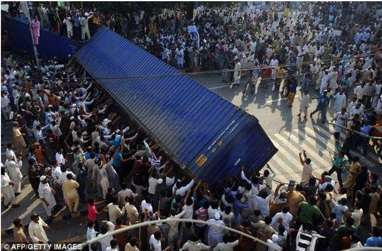
Toppling the barriers: The mass of people worked together to push down the freight containers set up by police