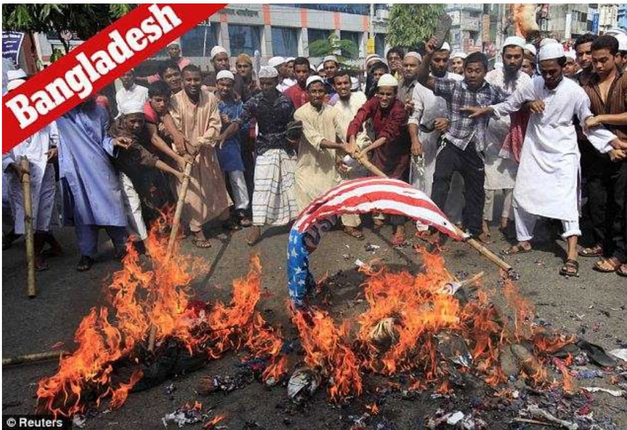
Fire starter: Protestors in Bangladesh targeted the American flag, as was seen in the demonstrations across the globe