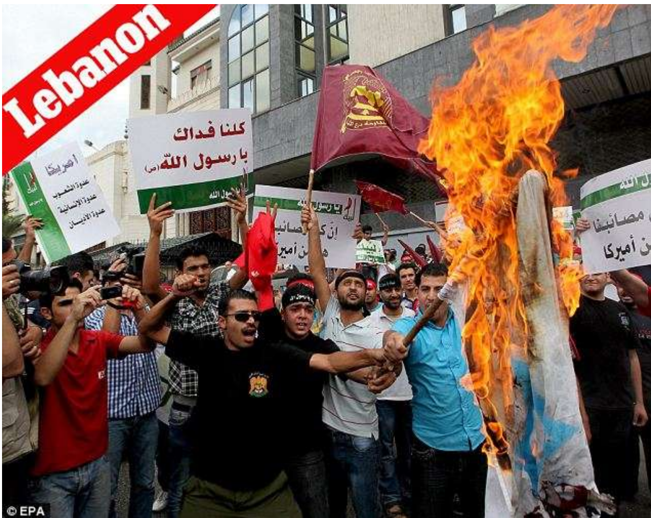
Fury: Young men burn an Israeli flag outside of a Mosque in Beirut, Lebanon