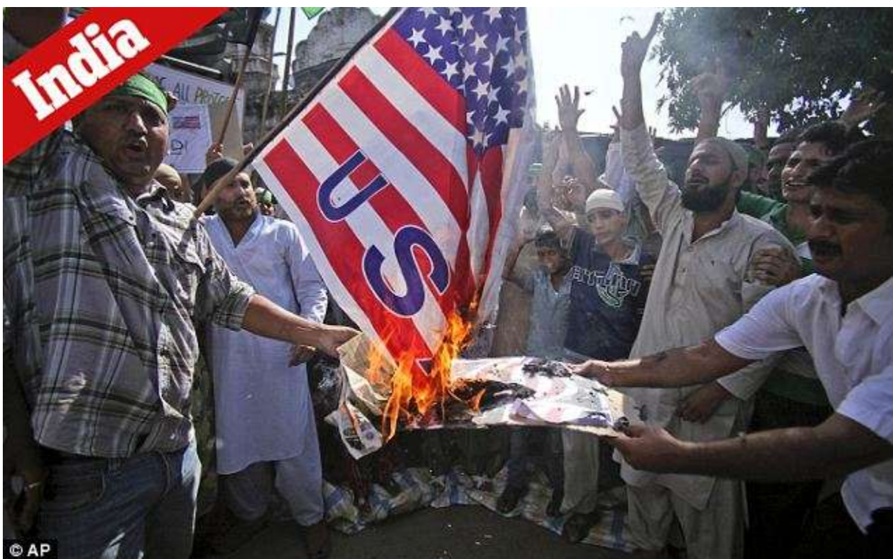
Volatile: The protests were sparked by an video called Innocence of Muslims which was made by an filmmaker in California, but it's reach has spanned the globe