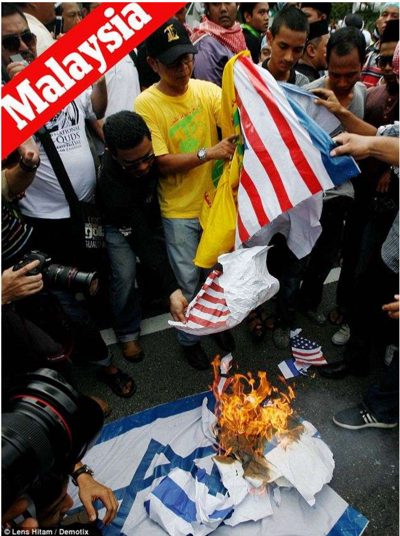
Allied targets: In Malaysia, Israel and the U.S. were both at the center of the protest