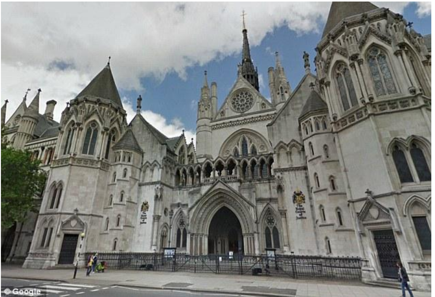
Judgement: Divorce cases could be settled by religious courts after a landmark High Court (pictured) ruling