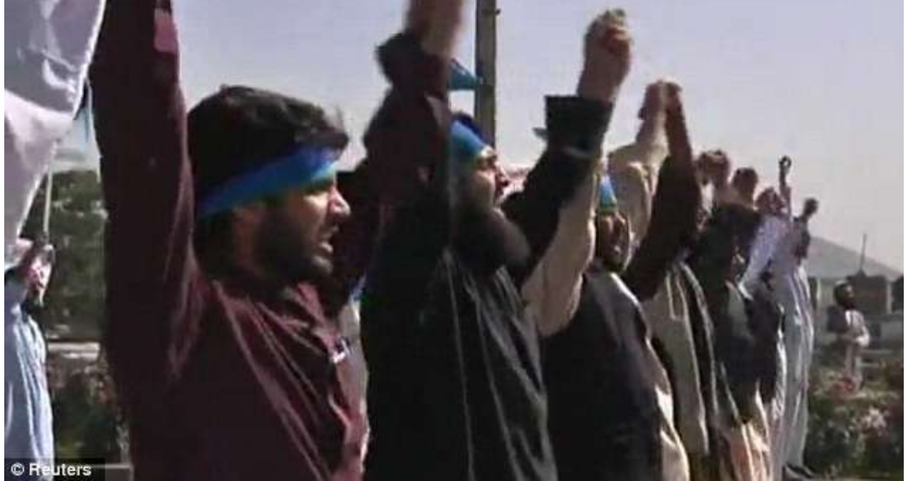
Peaceful: The protest, organised by Islamic group, the United Reformists Party, is in direct contrast to the displays of violence over the film seen around the world in recent weeks

Contrast: Around 500 Afghans have staged a peaceful protest in Kabul to condemn the now-notorious film mocking the Prophet Mohammad