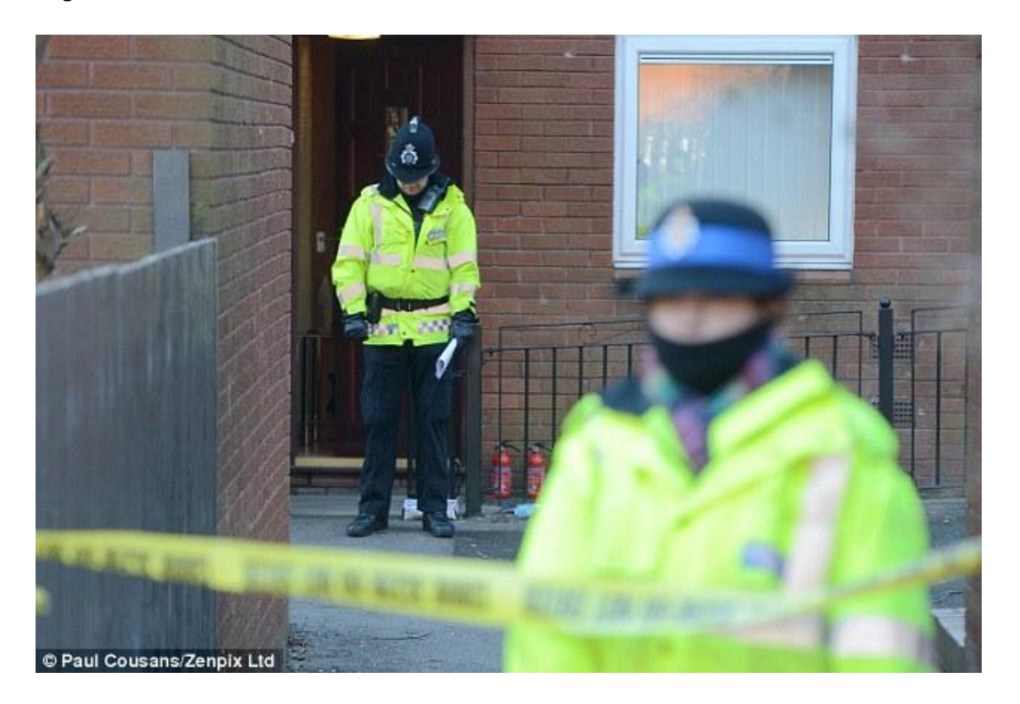
An officer stands guard at a police cordon near the house. Police have said it is 'too early to speculate' about what took place