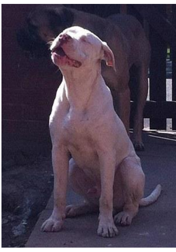
Destroyed: A male Staffordshire Bull Terrier (left) and Buddy (right) were put down by police after the death