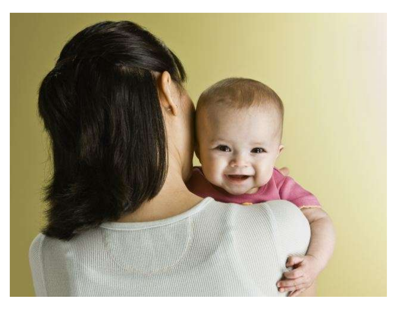
Crucial: A mother's love is fundamental to how a child's brain develops

The consequences of these deficits are pronounced - the child on the left with the larger brain will be more intelligent and more likely to develop the social ability to empathise with others.