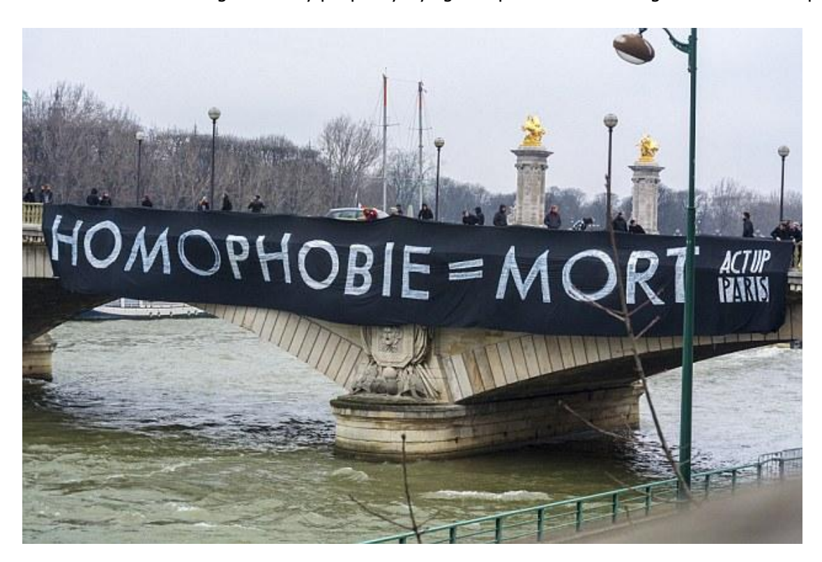
Anti-gay: Anti-AIDS activists, Act Up Paris, installed a huge banner (homophobia = death) at the demonstration. They were protesting what they claim is really a homophobic demonstration by the conservative opposition

His clumsy handling of other promises, including a 75 per cent top tax rate on the rich that was ruled unconstitutional, has angered thousands.