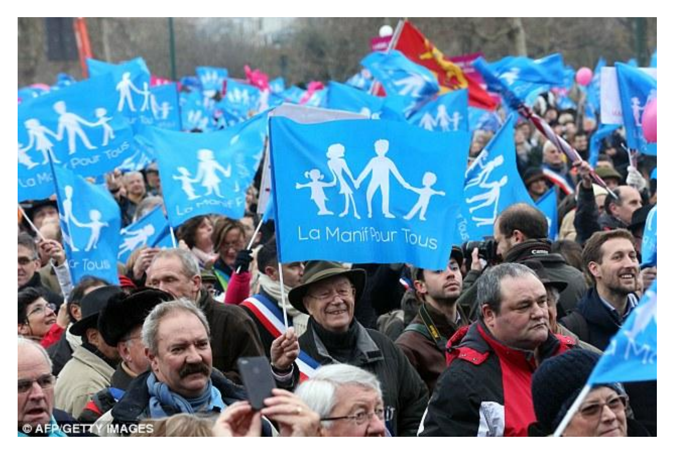
Between 50 and 88 per cent of people living in Franch are Roman Catholics, and conservative opposition for the proposed legislation has been enormous

Freezing temperatures and driving rain kept the numbers down, said a police spokesman, who reported no arrests.