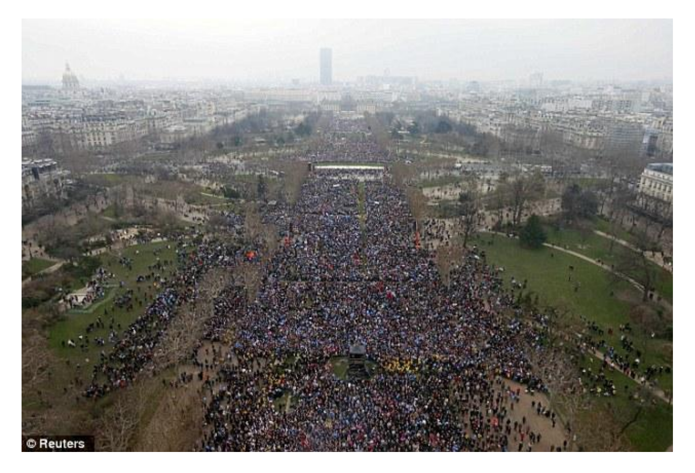
As far as the eye can see: Around five TCV high speed trains were specially hired to bring people from provincial towns along with 1000 coaches