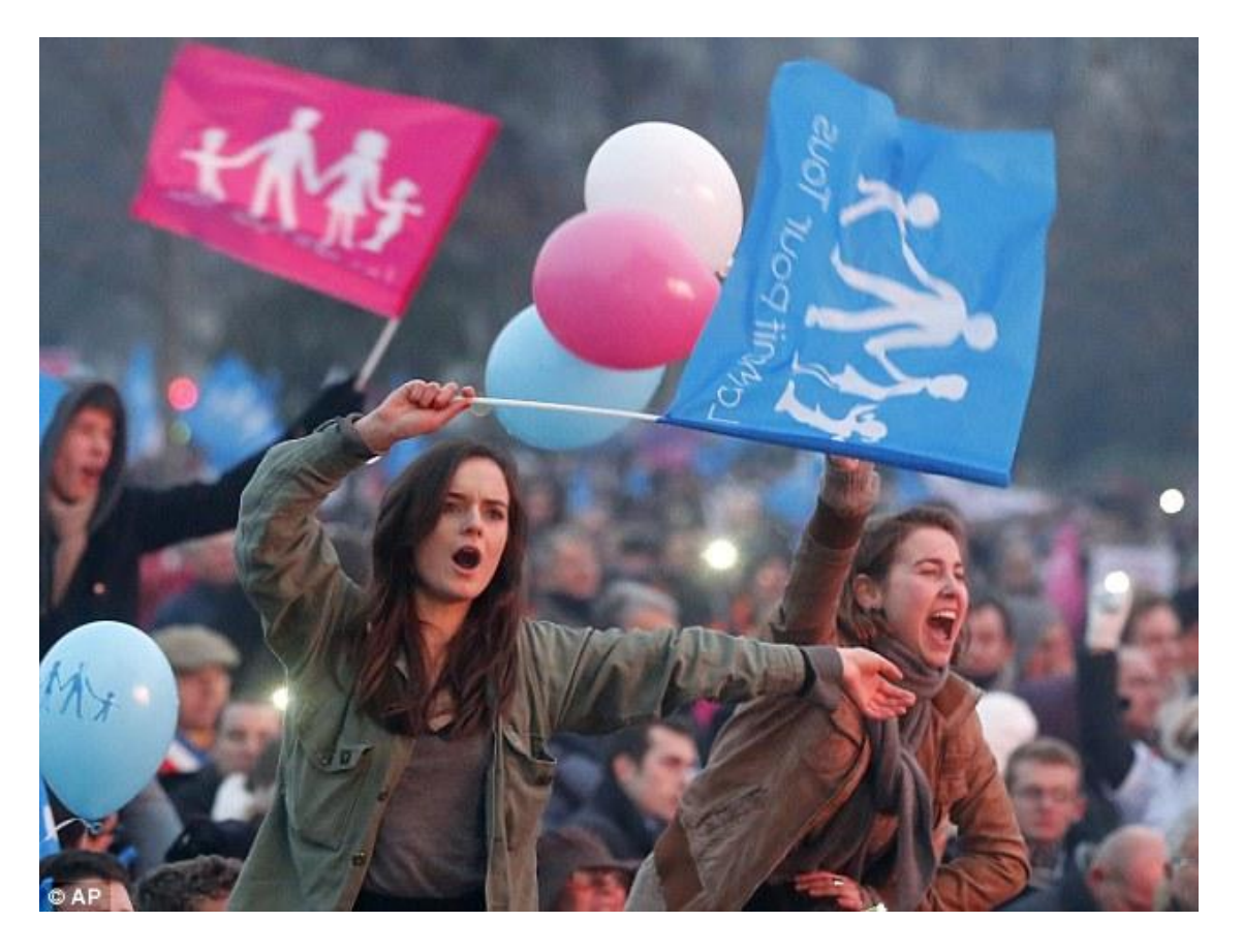
Protest: Mr Hollande angered many people by trying to slip the reform through with next to no public debate