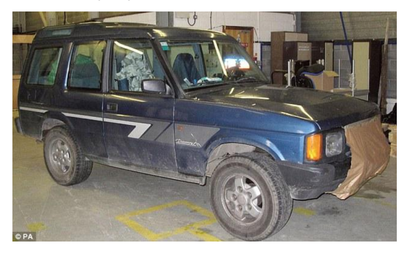
Evil: The jury saw images of Bridger's Land Rover Discovery heading away from town - April would already have been in the passenger seat after being abducted near her home