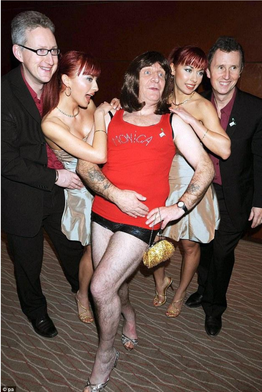
Mr Evans, right, is pictured with pop group the Cheeky Girls at a Parliamentary Palace of Varieties show for charity. He is joined by Lembit Opik MP, left, and Stephen Pound MP, centre,

He was also encouraged by fellow Welshman and rugby union star Gareth Thomas, who came out in 2009. 'If people like Gareth, who was married, can come out, it should be no big deal for me,' said Mr Evans. In 1998, Mr Evans voted against lowering the age of gay consent from 18 to 16. Two years later, he voted in favour of the measure. The law was finally changed in 2001.