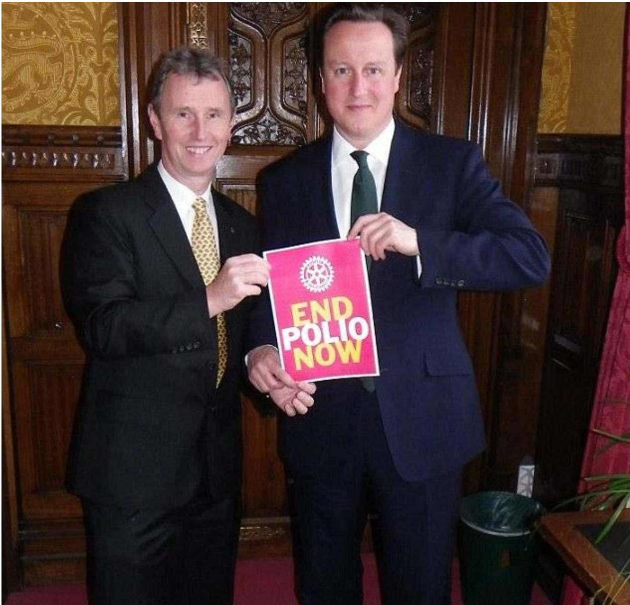
Arrested: Nigel Evans is pictured with David Cameron, who has been informed about the claims

The man will be interviewed at a police station in Lancashire during the course of the day. The offences are alleged to have been committed in Pendleton between July 2009 and March 2013.