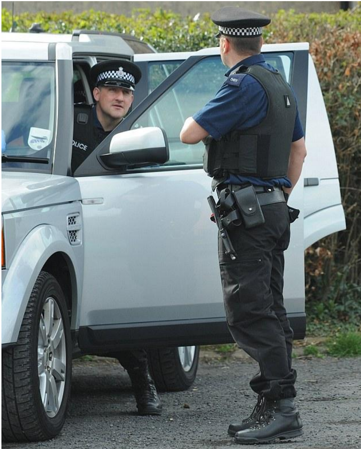
On patrol: Uniformed Lancashire Police officers maintain their presence in the village

He said: 'The MP was saying to anyone who would listen, "Why is it that Nigel Evans leads a life whereby he is gay to some people and not others?"'