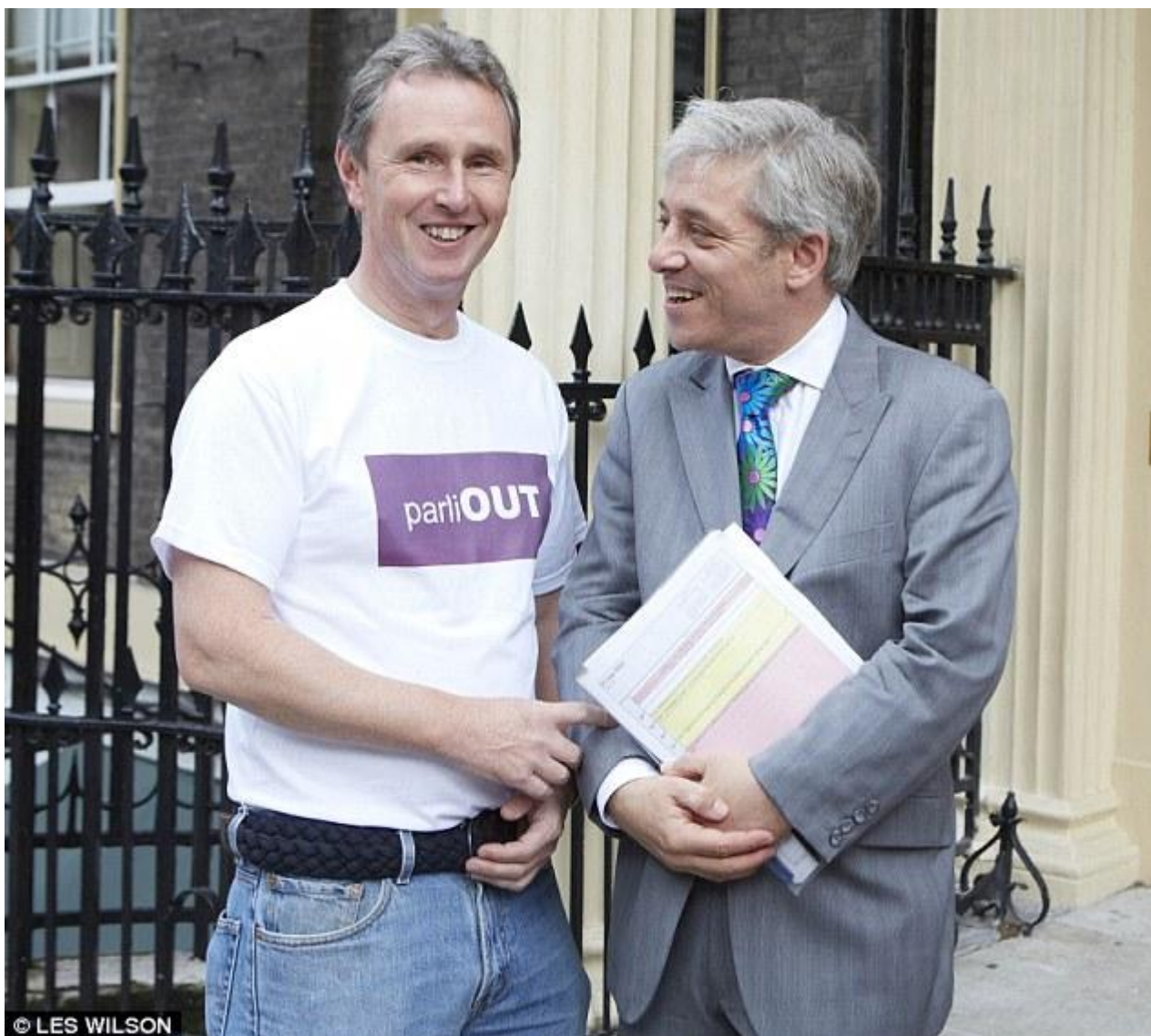
Making a stand: Mr Evans, left, is pictured with Speaker John Bercow, right, at last year's Gay Pride march

Mr Evans refused to name the Labour politician, but added: 'I could not afford it to be used as leverage against me. I couldn't take the risk. I don't want any other MP to face that kind of nastiness again. I am sure there are other gay MPs who would like to be open about their sexuality but are fearful of the consequences. I hope this new group will help them to do so.' Mr Evans's decision to come out was partly as a result of a chance conversation with a friend, the actress Vicky Entwistle, who played Janice Battersby in Coronation Street and who lives in Mr Evans's Ribble Valley constituency.