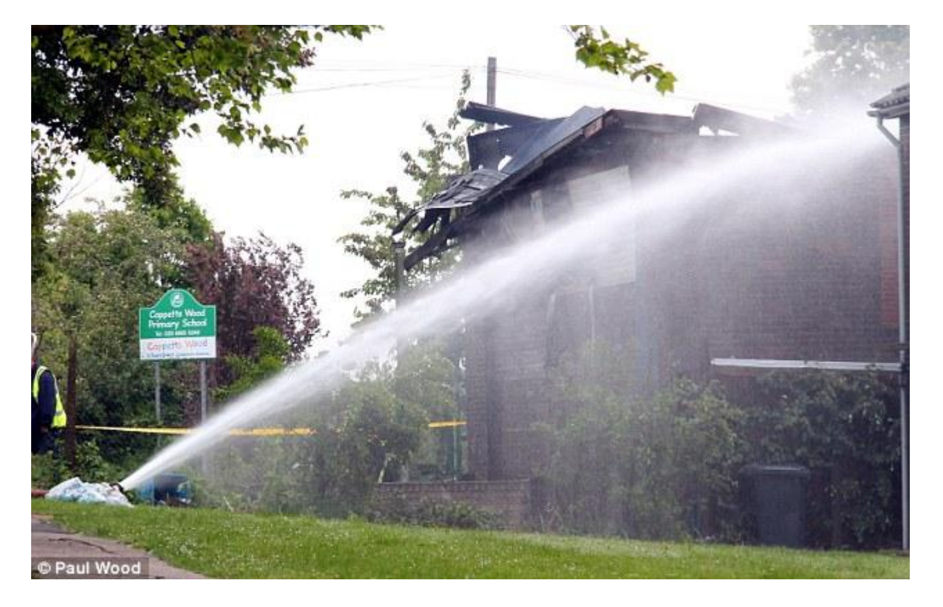
Wreckage: Firefighters damp down at the scene of the blaze after they were called out in the early hours of yesterday