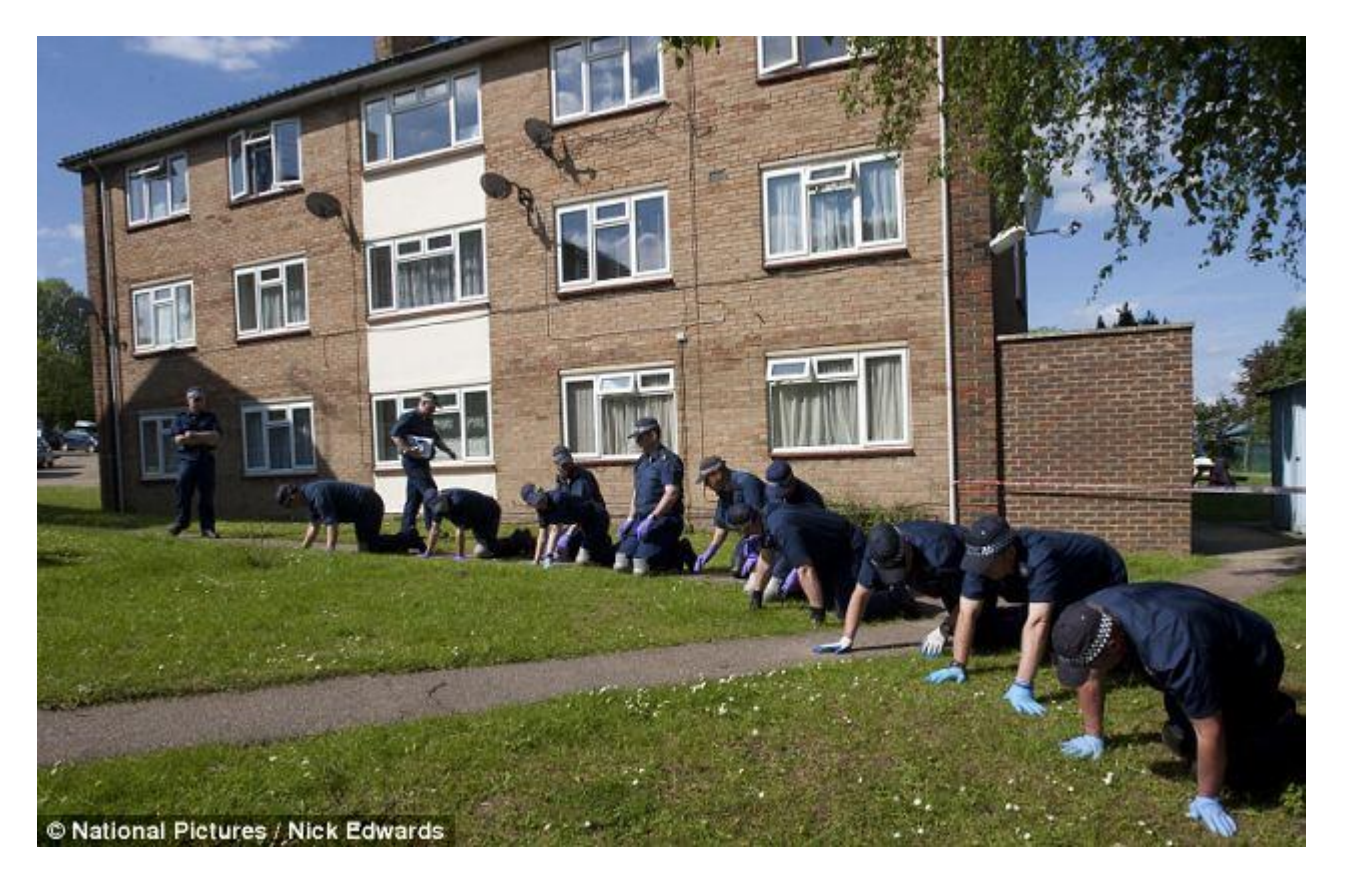
Police search the scene on Coppetts Road for clues as to how the fire was started