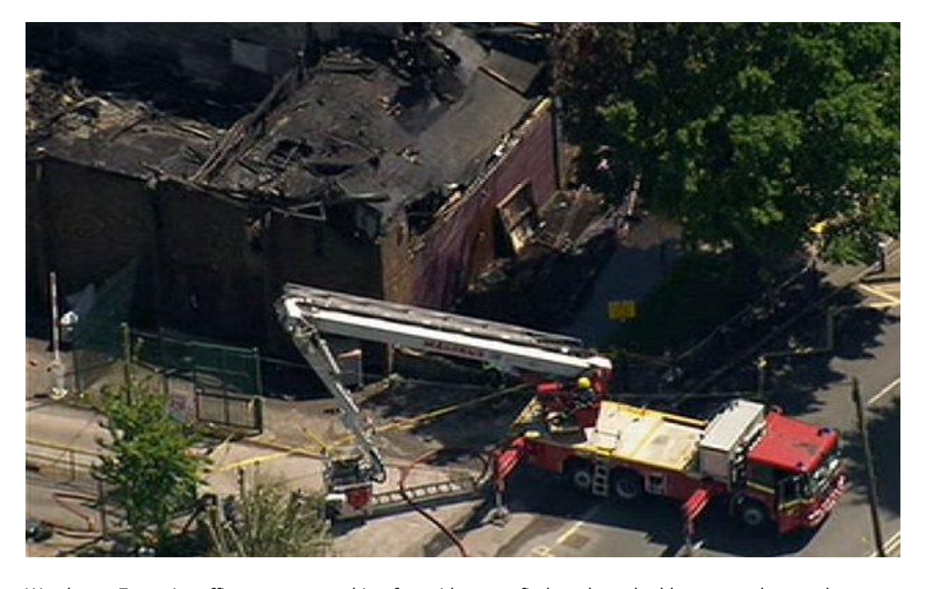
Wreckage: Forensics officers were searching for evidence to find out how the blaze started yesterday