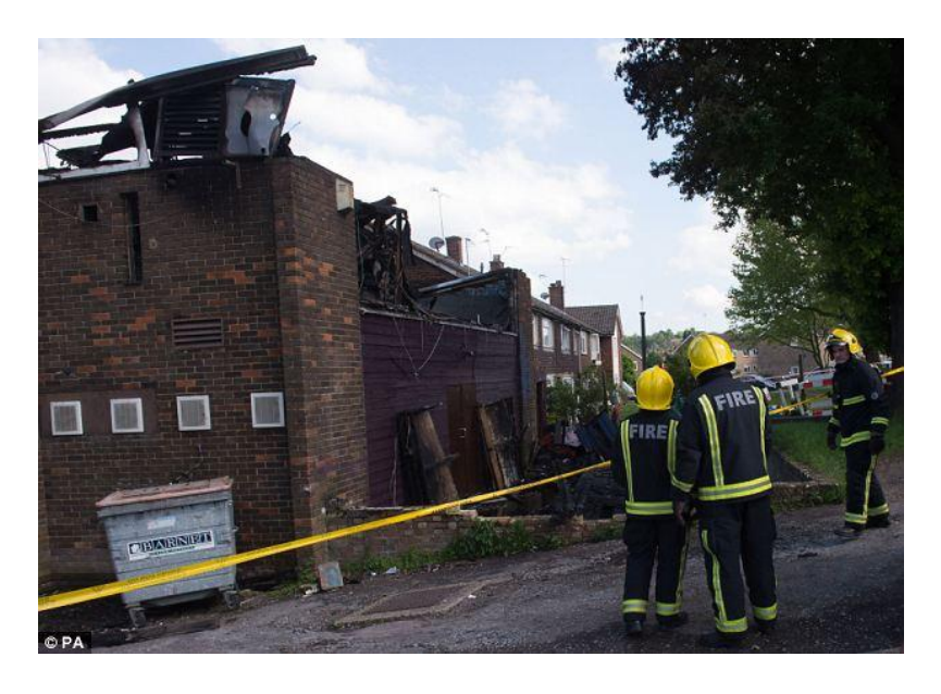
Hunt: Police look for evidence near the Islamic centre after it was revealed graffiti saying 'EDL' was daubed on the building