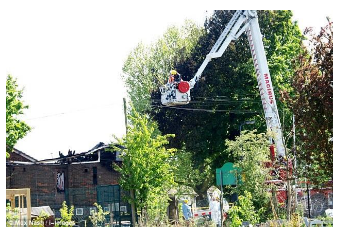
Firefighters use a lift to view the damage caused by a fire in the Islamic center in Muswell Hill