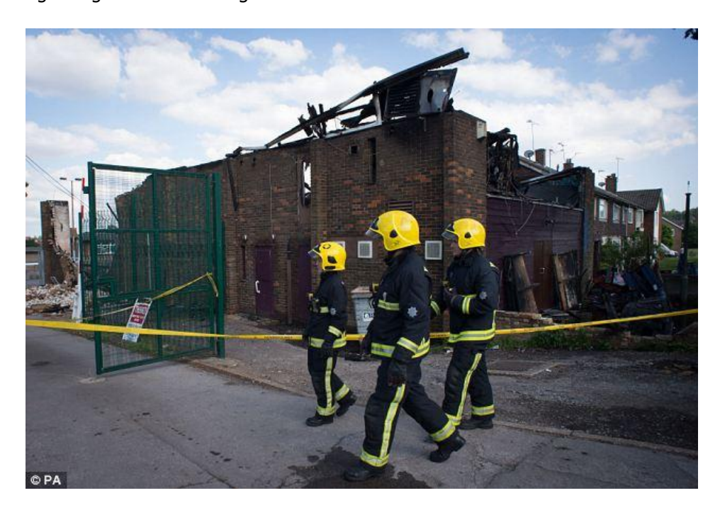
Firefighters on the scene at the Bravanese Centre yesterday afternoon after it caught fire overnight