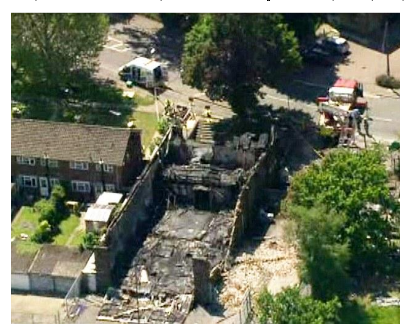
Completely destroyed: The building will have to be rebuilt after the fire as this picture shows