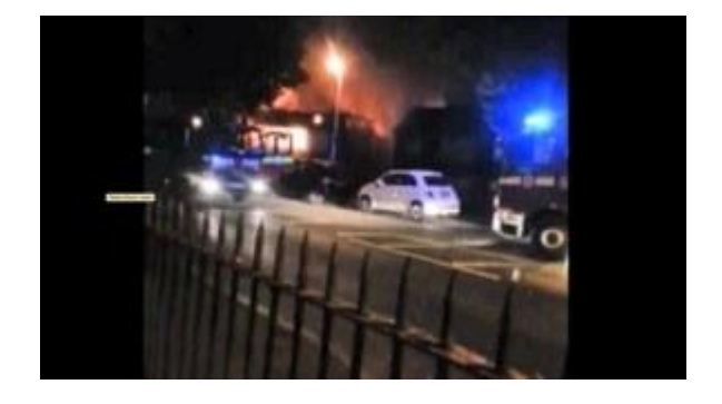
'EDL graffiti' found on burned down Islamic centre