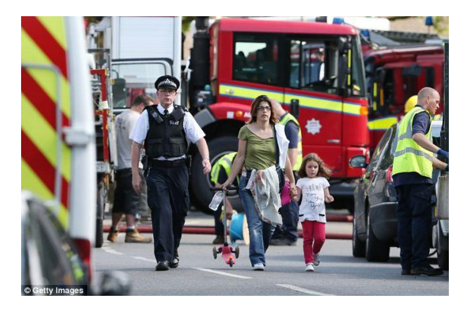
A policeman walks with a mother and her daughter past the fire damaged centre yesterday afternoon