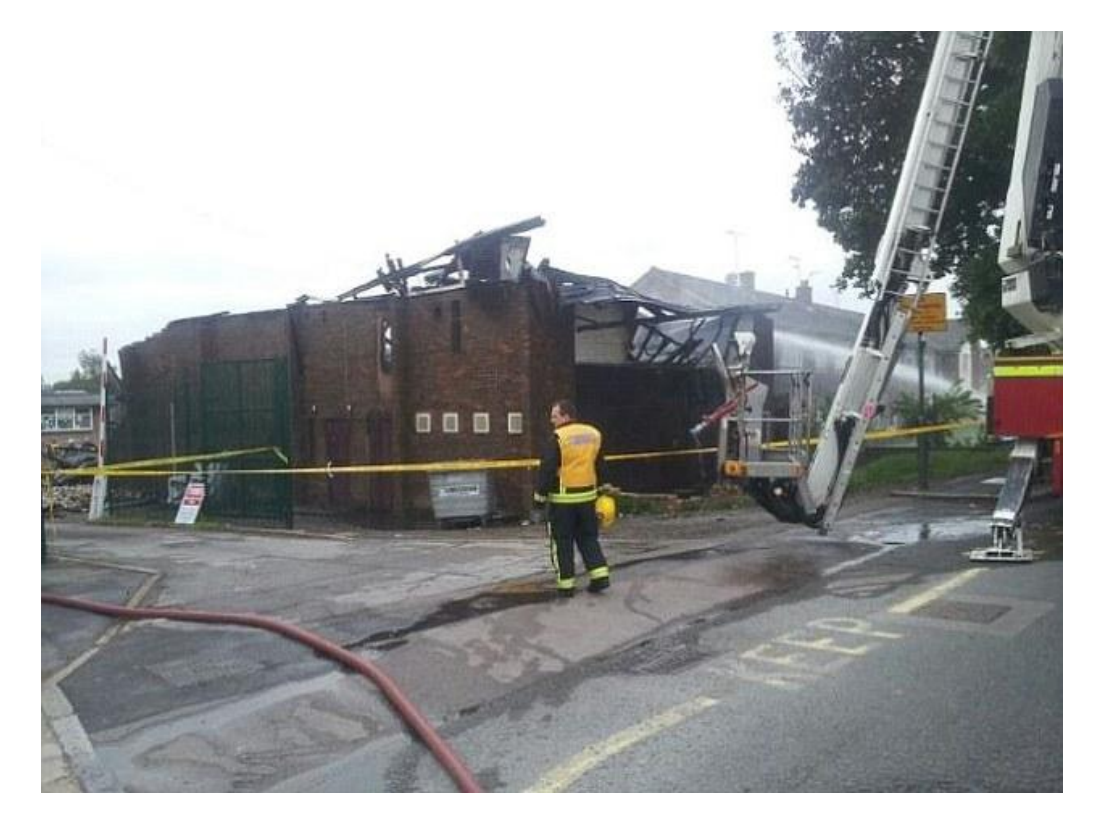
Aftermath: The Metropolitan Police said an investigation had revealed the graffiti apparently linking the fire to the farright English Defence League

Firefighters were called to tackle the blaze in Muswell Hill. So far there have been no arrests