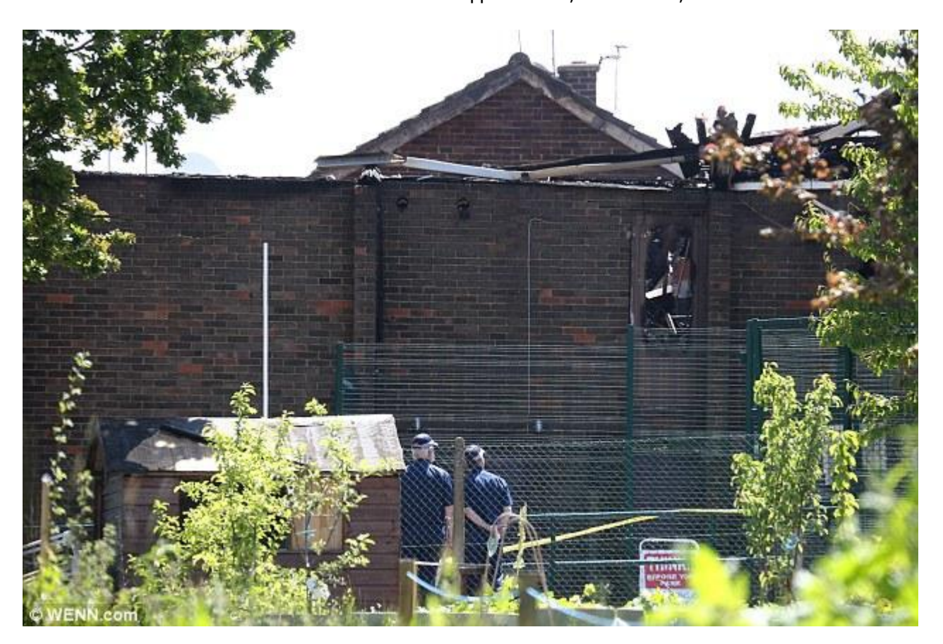
Investigation: Police officers can be seen at the scene in Muswell Hill yesterday as an investigation begins