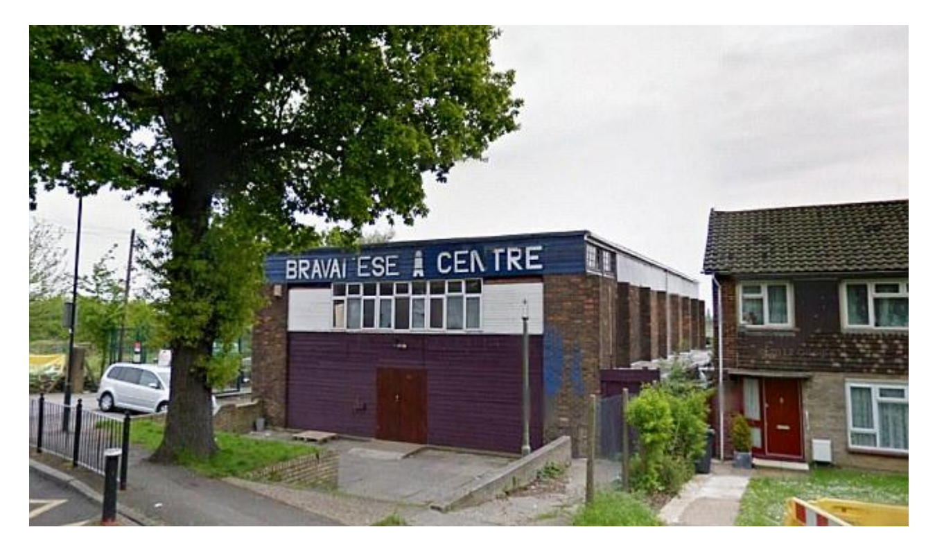
The Somalian Islamic Bravanese Welfare Centre in Coppetts Road, Muswell Hill, which was on fire