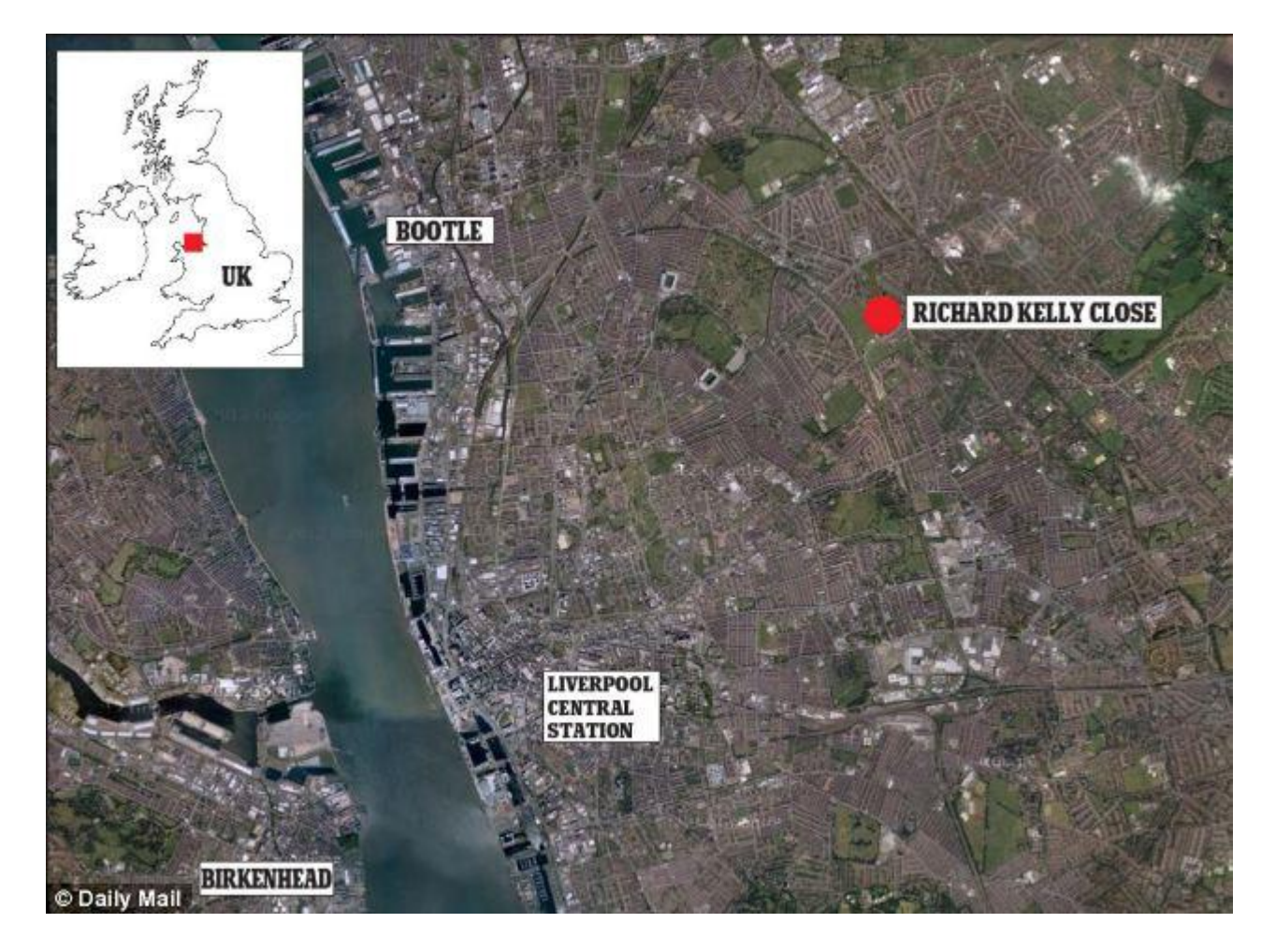
Richard Kelly Close, in Clubmoor, is around three miles from Liverpool city centre