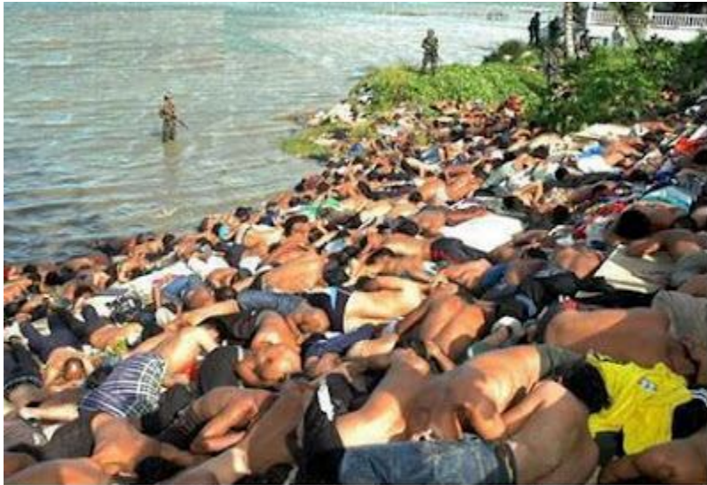
Continuity of Massacre of Muslims of Burma by Budhists More than 1000 Killed Yesterday – Please SHARE for the awakening