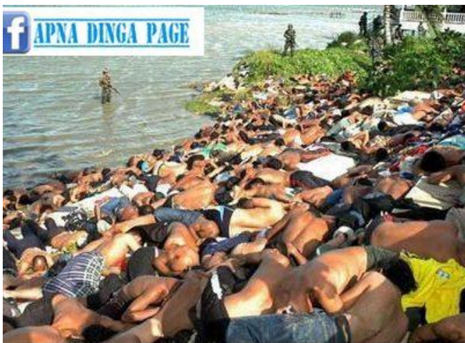
Continuity of Massacre of Muslims of Burma by Budhists more than 1000 Killed Yesterday – Please SHARE for the awakeni

The notorious master hypocrite and undercover CIA agent, Dalai Lama, continues to globe trot without mentioning a single word of the dangerously growing Buddhist intolerance in Burma, Thailand, Tibet and across the world. Such intolerance and persecution invariably result in resistance by the oppressed. Many Muslims have joined armed resistance groups, fighting for greater freedom in Burma. On June 3rd 2012, eight Muslims returning to Rangoon in a bus after visiting a Masjid in the Arakan province were attacked by a mob of hundreds of Buddhists and slaughtered brutally. An eye-witness reported that after the mass murder "the culprits were celebrating triumph spitting and tossing wine and alcohol on the dead bodies lying on the road." "These innocent people have been killed like animals," said Abu Tahay, of the National Democratic Party for Development, which represents the country's much-persecuted stateless Muslim Rohingya community. The Rohingya Muslims of Burma have continued to suffer from human rights violations under the Burmese junta since 1970s. Over the years thousands of Rohingya refugees have fled to neighboring countries like Thailand, Indonesia and Bangladesh etc. Even as refugees they have been facing hardships and have suffered persecution by the Thai government.